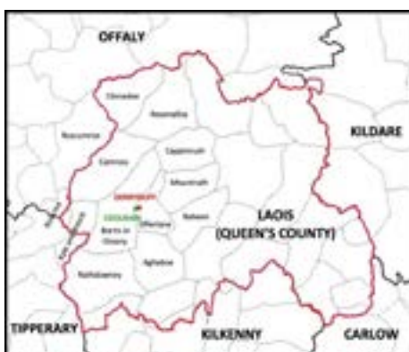
Fig. 1 Derryduff and Coolrain townlands and the surrounding Catholic parishes

In addition, websites FamilySearch and IrishGenealogy.ie provide free access to church records. IrishGenealogy.ie covers counties not included at RootsIreland.